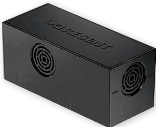
ALONEatWORK® communication module

ALONEatWORK® is optionally available for the luminaires LIGHTPAD, TWEAK, TWEAK Essential and LEVEL. The luminaire LIGHTPAD Tunable is equipped with ALONEatWORK® as standard.