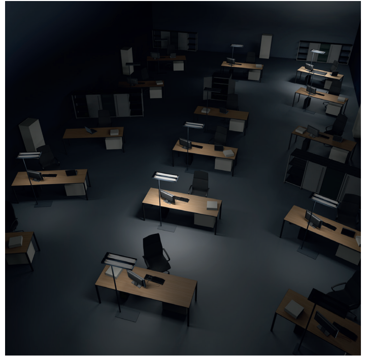
Simulation of pleasant clouds of light with ALONEatWORK ®