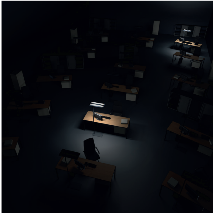
Simulation of an open-space office with isles of light

ALONEatWORK ® creates a pleasant lighting atmosphere even when you are surrounded by unoccupied desks